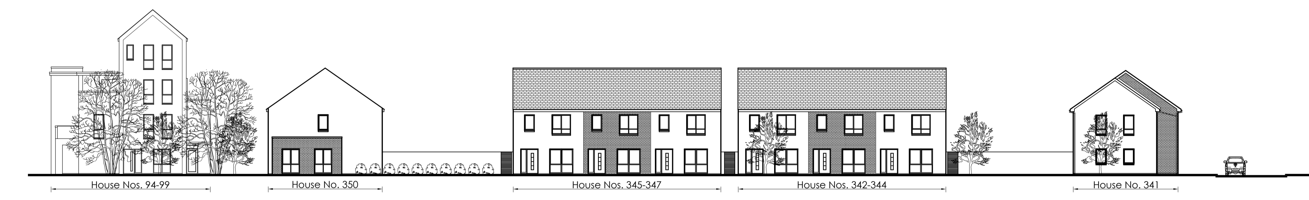
Contiguous Elevation No. 16