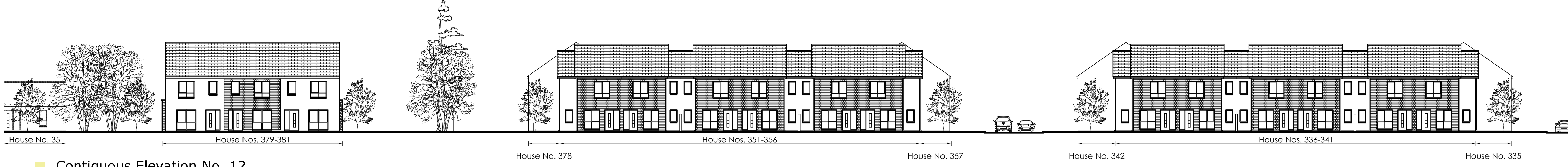
Contiguous Elevation No. 12